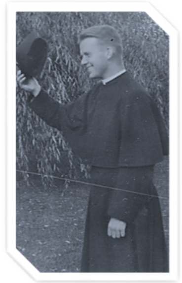
“Hello, I must be going...”

And in that, we are probably not so different from many parallel Catholic religious institutes and apostolates. Standard operation conditions after all. The question: how to tell the story, our story.