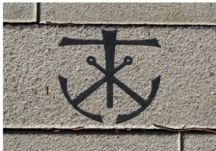
Campus paving stone, Library Plaza

Within the activities of the Archives is the management of an outward-leaning educational web-page, PortLog , a digital magazine. Throughout the year we post ‘one-page’ sketches which might feature an artifact in our collection, a historical anniversary, or some anecdote crying out for attention. In this digital activity, the Archives received the charge that the web-articles might highlight and articulate the continuing Catholic and Holy Cross mission of our school. The example below welcomes the new president. The link at the bottom is an article on religious identity: “1901-1928: More Catholic or More College?” (While not daring to promote the examples here as best-practice—see the deprecations above—feel free to steal from the models if they are useful.)